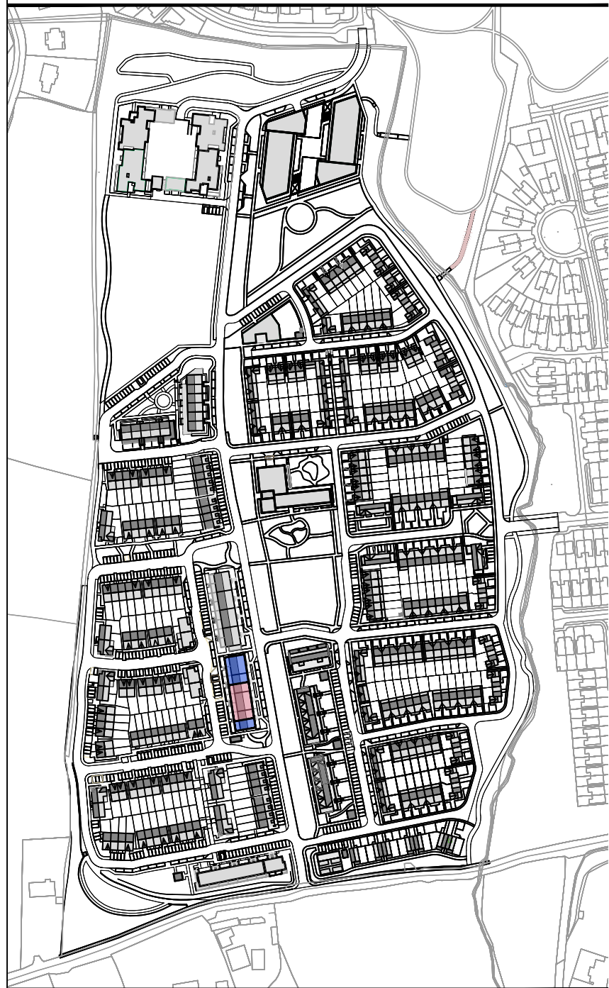
GROUND FLOOR PLAN - 1:200@A3

NOTE: DO NOT SCALE FROM DRAWINGS. WORK TO FIGURED DIMENSIONS ONLY. ARCHITECT TO BE NOTIFIED OF ALL DISCREPANCIES.